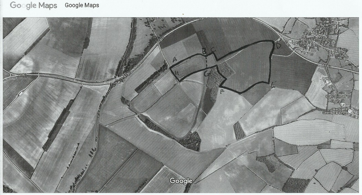
14,3,6, H Small Llem 14,13,0,0,0,F,G,H 13:9 3km

UIS Bogs + Girls, A, B, G, H, A, B, C, D, E, F, G, H 4km